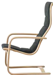
Lamello easy chair