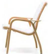
Laminett easy chair

Ur Yngve Ekströms rika produktion, ett urval möbler som fortfarande produceras av Swedese: