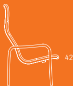
Melano easy chair