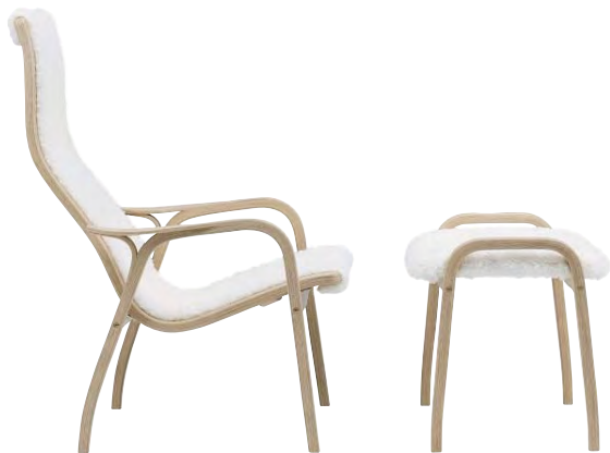
Lamino easy chair, stool