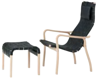
Primo easy chair, high back