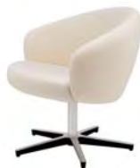
Rondino swivel chair